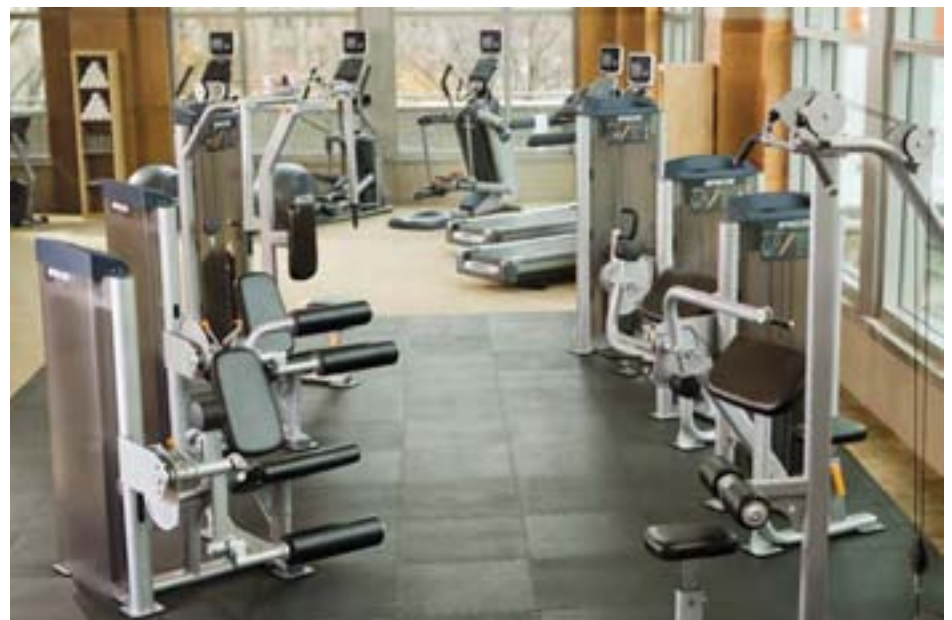
Precor's low-profile S-Line circuit machines are a good fit for hospitality's limited-space applications.

health club experience, an entertaining way to get fit and stay fit. The evolution of these residential products has paved the way for hotels and resorts to offer similar solutions. Suddenly, fitness-driven revenue streams are not limited to the fitness center itself, but can expand to the in-room experience. Hotel, villa and condo operators should