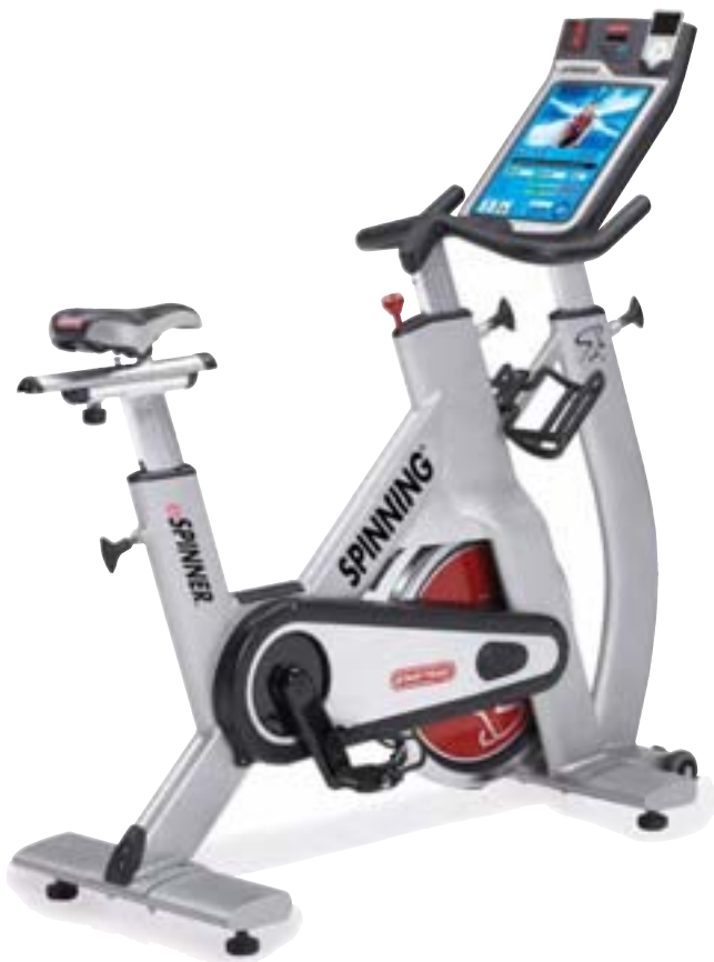
E-Spinner's full-color touchscreen monitor makes a simulated group exercise experience possible for individuals without a live instructor.

Another company gaining a lot of attention is I-Tech Fitness and its XRKADE. The XRKade is similar to a gaming system found in an arcade setting, and it allows the user to choose a variety of games that are based on different forms of exercise or activity. For example, a user could engage in a full-blown karate battle, surf Hawaii's majestic waves, cycle through the European countryside or participate in a high-energy dance