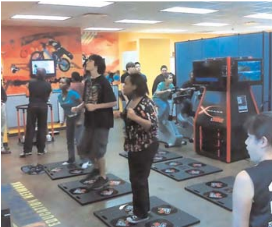
The XRKade, with its varied product applications, provides potential for new revenue when offered on a pay-for-use basis.

competition – all from a single XRKade machine. Though originally conceived and created in response to the childhood obesity crisis as a means of getting children to be more active, the XRKade is fun for everyone. Thus, it is an ideal solution for family-vacation travelers.